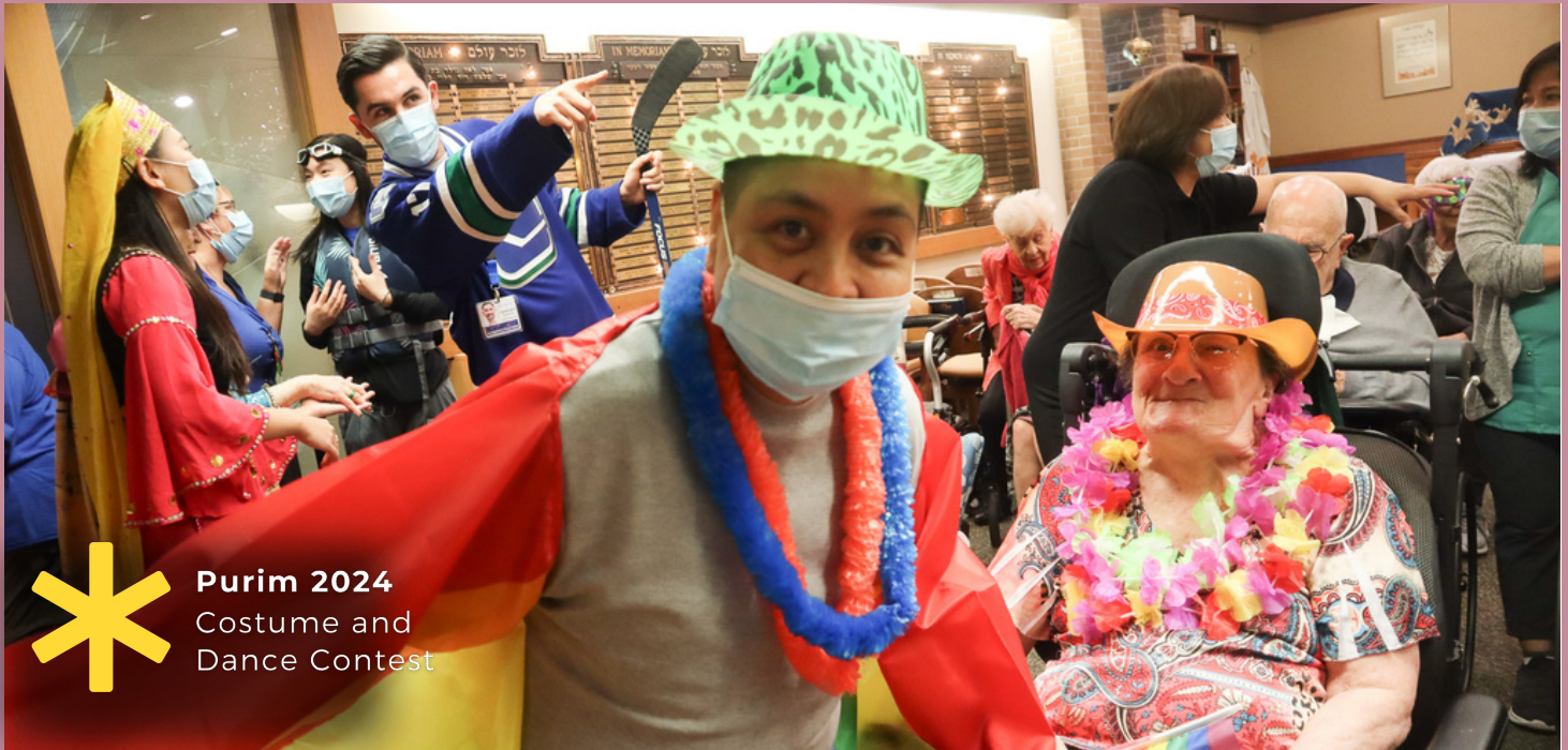
Purim 2024 Costume and Dance Contest