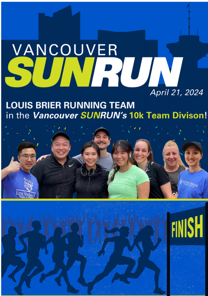
ABOVE: The Louis Brier Running Team