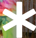
Residents, Staff, and Companions participated in the 2023 Purim Costume and Dance Contest